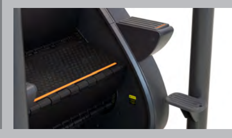
VISUAL SAFETY LINES. Each step has an orange visual line at the limit of the step to visually control the end of the step.

EXTRA STEP. With this extra step on the side, we increase the user's safety when starting and stopping the exercise.